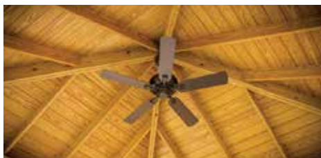
Stained Wood (Standard)