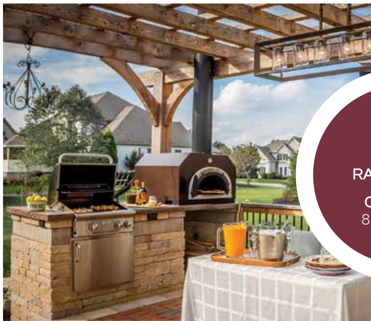
Top Photo: 16x16