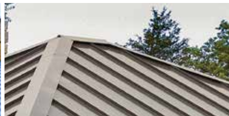
Standing Seam Metal (Deluxe Upgrade)