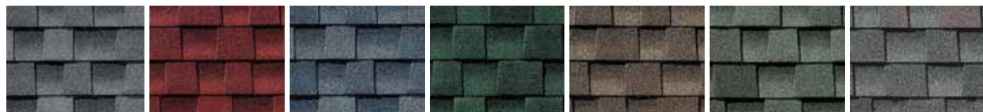
Oyster Gray Patriot Red Biscayne Blue Hunter Green Mission Brown Slate Williamsburg Slate