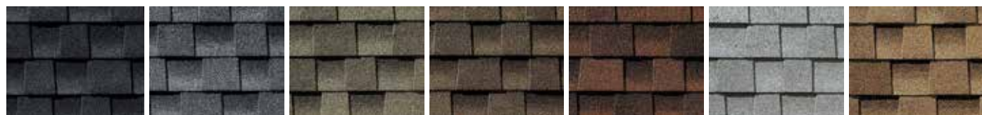
Charcoal Pewter Gray Weathered Wood Barkwood Hickory Fox Hollow Gray Shakewood