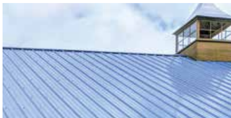
Regular Metal (Premium Upgrade)